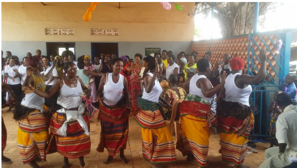
A photo showing the women dancing during the weekly meetings at Kireka cultural center

Whenever our clients get the chance to kick a ball or sing and dance, they feel free and they forget their problems for a while. By singing and dancing together our women and youth get the strengths to face daily toil. The women in Naguru and Kireka also benefit from the physical exercises sessions that are carried out by the youth of New Hope Dance Project Uganda (NHDP) every week.