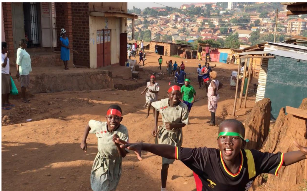
Figure 8: A photo showing the LGPPS students during the slum marathon (Olympics)

P.O.Box 21261, Kampala, Uganda - Tel. +256 0414 222 698 - e-mail: mpi@meetingpoint-int.org