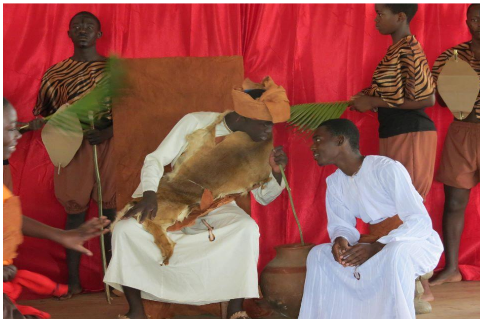
A photo showing the LGHS students acting a stage play

P.O.Box 21261, Kampala, Uganda - Tel. +256 0414 222 698 - e-mail: mpi@meetingpoint-int.org