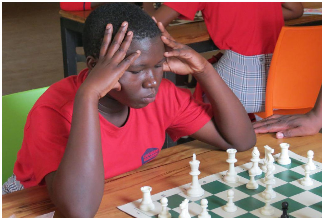
A photo showing the LGHS students during the chess lessons and completions

P.O.Box 21261, Kampala, Uganda - Tel. +256 0414 222 698 - e-mail: mpi@meetingpoint-int.org