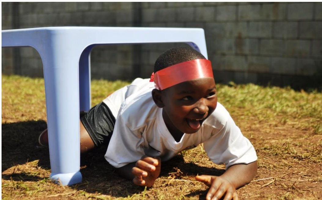
A photo showing one of the child enjoying some of the sports activities at LGPPS

P.O.Box 21261, Kampala, Uganda - Tel. +256 0414 222 698 - e-mail: mpi@meetingpoint-int.org