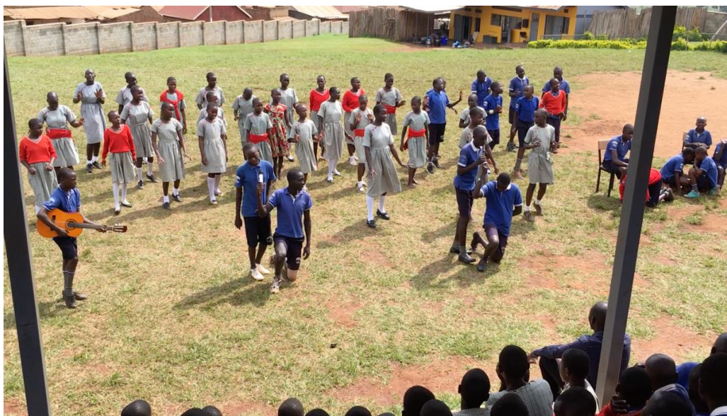
A photo showing the pupils performing a dramatic play during the Wednesday assembly

The Wednesday assembly can also be the chance to present part of the work that a class did during the lesson time: explanation of a topic or a particular project carried out during the year. Thereafter, the school closes at 3pm. It closes early in order to allow the teachers to have their weekly staff meeting, an important moment of reflection about the educational proposal the school is carrying out, challenges they are facing and proposal of new strategies.