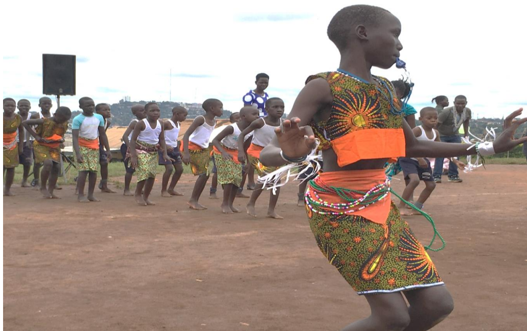
A photo showing the LGPPS students performing a traditional dance during the MDD

P.O.Box 21261, Kampala, Uganda - Tel. +256 0414 222 698 - e-mail: mpi@meetingpoint-int.org