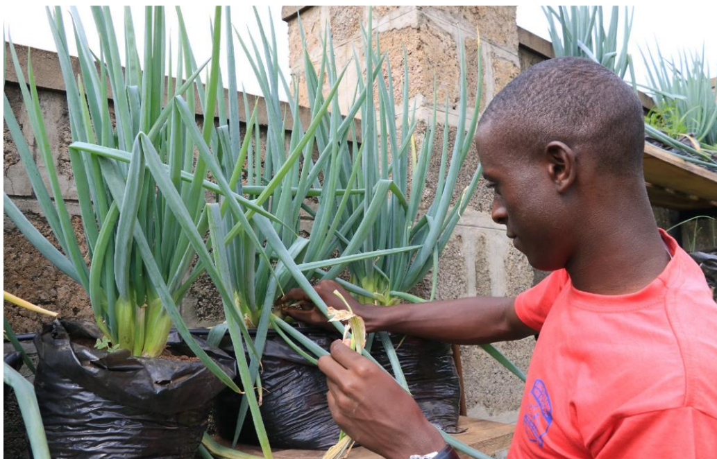
A photo showing one of the students practicing vertical gardening at LGHS

P.O.Box 21261, Kampala, Uganda - Tel. +256 0414 222 698 - e-mail: mpi@meetingpoint-int.org