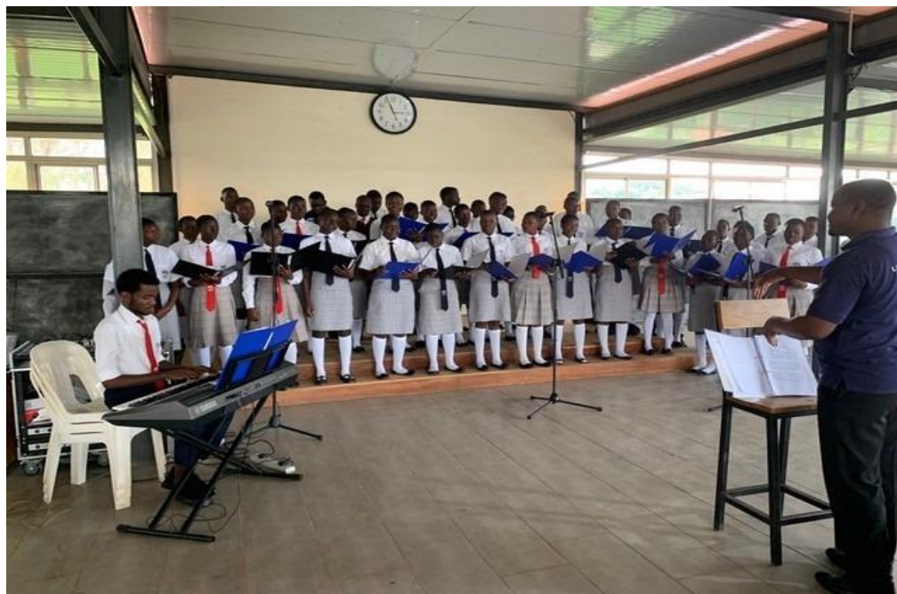
A photo showing the students and their choir master during the Christmas carols at LGHS

P.O.Box 21261, Kampala, Uganda - Tel. +256 0414 222 698 - e-mail: mpi@meetingpoint-int.org