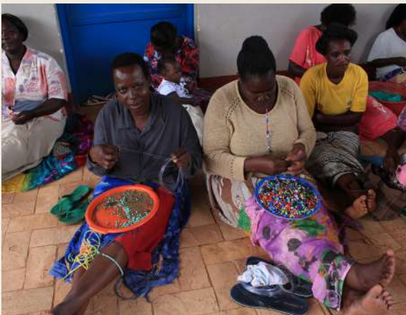
Woman at Meeting Point International Kireka making beads.

The therapeutic outcome that results from sitting together and making these necklaces and plan the business they are going to build with the saved money is immeasurable.