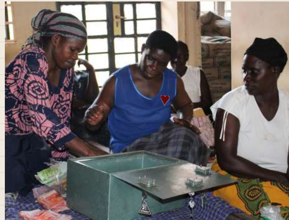
The Women of Meeting Point International Naguru sharing their Money after saving at the end of the year